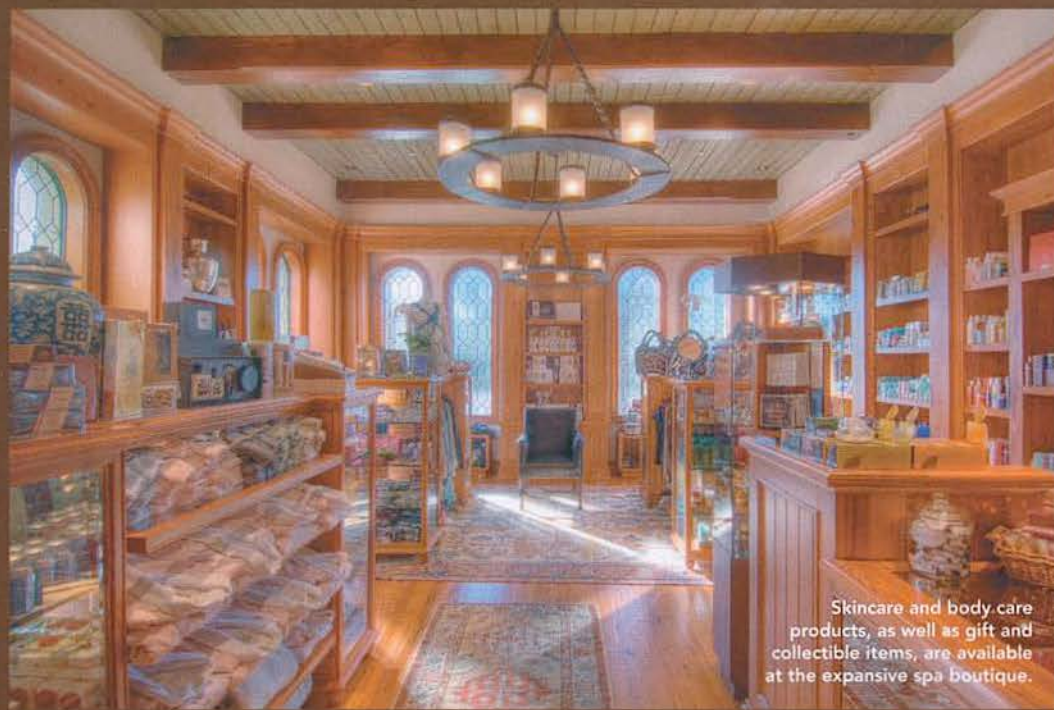
Skincare and body care products, as well as gift and collectible items, are available at the expansive spa boutique.