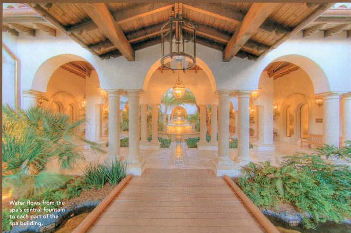
Water flows from the spa's central fountain to each part of the spa building.