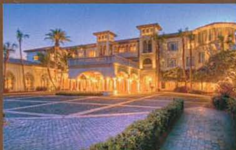
The Cloister (pictured above) and the spa building blend Mediterranean and Spanish design styles.