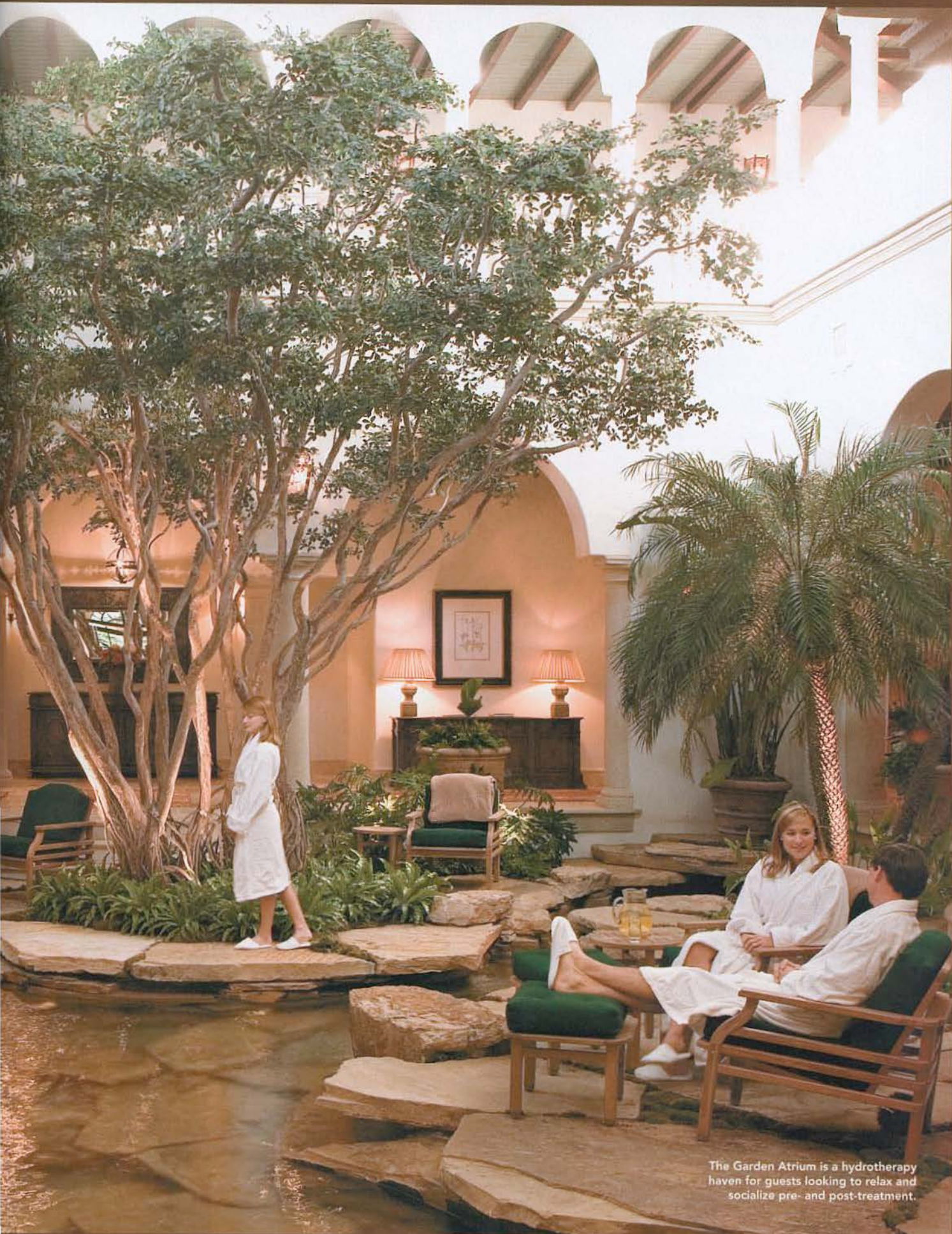
The Garden Atrium is a hydrotherapy haven for guests looking to relax and socialize pre- and post-treatment.