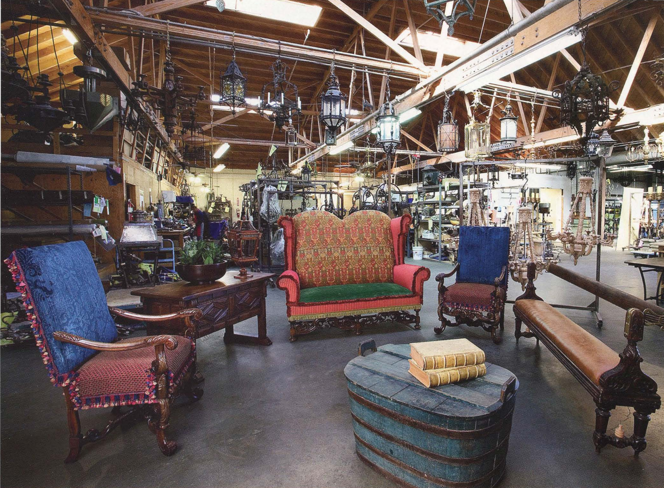
Raynor's European selections (left) for The Cloister include two French upholstered Louis XV-style walnut armchairs, a Spanish-style 19th-century settee and a yacht's bench with a reversible back rail. Other Cloister finds (opposite page), such as a painted wheat basket along with an antique wire birdcage and English milk bowl, sit in front of a reproduction of an 18th-century corner cabinet.

FROM ITS COMMANDING public spaces to the intimate seating areas of its guest rooms, the new Cloister hotel had to meet a set of high standards established by history itself. Those standards called for the finest quality antique furniture and lighting, in multiples and on a grand scale. For so ambitious an assignment, The Cloister's interior designer, Pamela Hughes, turned to antiques dealer Tom Raynor. Over the course of a year, Hughes purchased not 10, 20 or 50 important pieces, but more than 3,000 items—urns, tables, cupboards, planters, lanterns and chandeliers—from Raynor, owner of Paul Ferrante, an antiques shop that has been a fixture on Los Angeles's posh Melrose Place since 1960. Paul Ferrante is a destination for designers across the U.S., and pieces there have found their way into the homes of everyone from music star Sheryl Crow to philanthropist Wallis Annenberg.