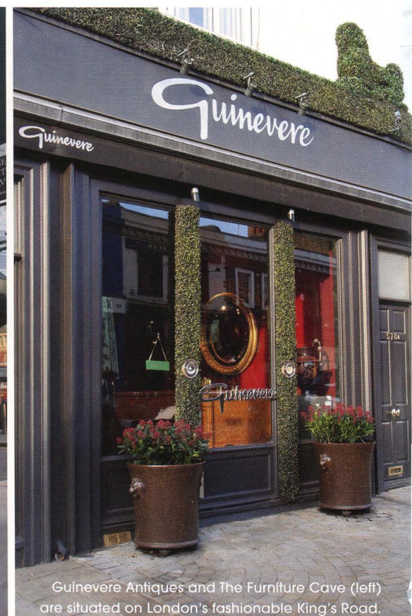
Guinevere Antiques and The Furniture Cave (left) are situated on London's fashionable King's Road.