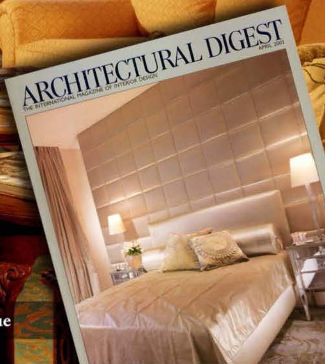
As seen in Architectural Digest , April 2003 Issue