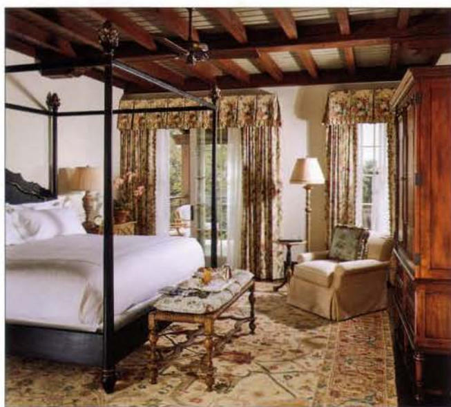
BELOW LEFT: The Sea Island Suite faces the Black Banks River. In one of its two bedrooms, the four-poster, bench and night table are from Hamilton. Samuel & Sons pillow tassel. Brunschwig & Fils stand. Lee Jofa drapery fabric. Casa del Bianco bed linens. Schumacher floor lamp.