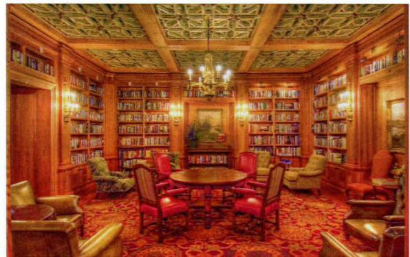
Photo above and to the right: The Cloister at Sea Island. Designed by Hughes Design Associates.

We recently had a client that adored embellished surfaces. So almost every surface of the home has some sort of applied special paint finish, even all the baseboards, floor casings and crown mouldings. In order to do that amount of work we had to make sure the painting was subtle and added nuance and elegance, and that the surfaces did not compete with one another. So, we had artisans do a gentle striae technique which